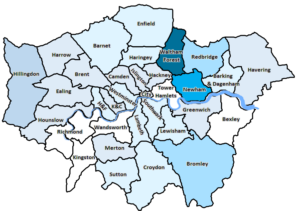
Note: boroughs in dark blue are those where we have the most clients. Boroughs in white are those were we have no clients as yet.

by the end of March 2020, Stay Safe East was working with clients in 16 London boroughs. By the end of March 2021, our second year of working across London, we had clients in 27 out of 33 London boroughs. Waltham Forest and Newham remain our 'core' boroughs, with one hate crime advocate and 2 domestic abuse advocates funded to work solely in those boroughs. Our advocates had to work hard to get to know other boroughs, find out contacts for social services or housing, or signpost clients to local resources, Covid volunteer schemes or local grants giving charities. we are building up knowledge and contacts, and are slowly getting to know courts and other facilities across London.